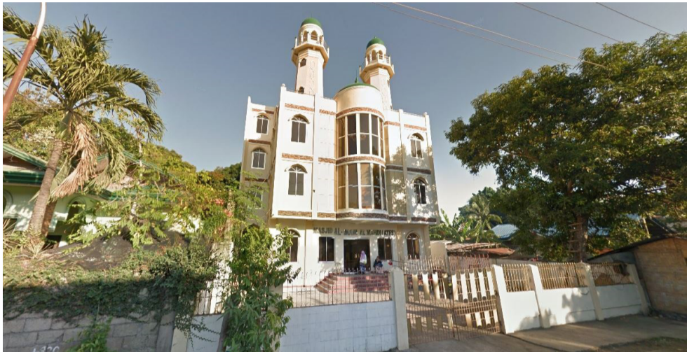
Moschea a Zamboanga City, Sutterville Taupan Road